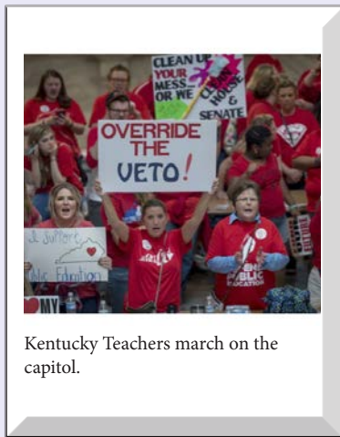
Kentucky Teachers march on the capitol.