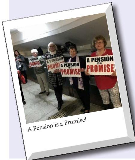
A Pension is a Promise!