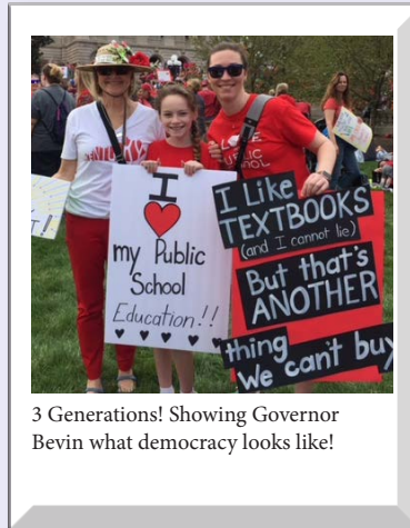
3 Generations! Showing Governor Bevin what democracy looks like!