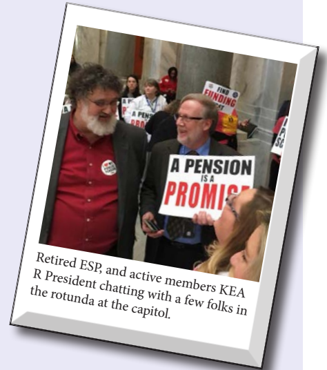
Retired ESP, and active members KEA R President chatting with a few folks in the rotunda at the capitol.