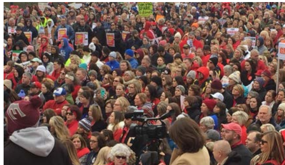
Standing united with our KEA colleagues—Teachers, ESP, and Retired at the steps of the capitol.